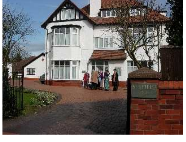
Visit to Seafield during the EGC

Those who went to Liverpool for the planned day out were delighted with the experience of Mass in the Metropolitan Cathedral, lunch in Seafield and Arrowsmith, a visit to Sacred Heart College (old Seafield) a tour of our first foundations in Liverpool, and a quick visit to the Anglican Cathedral.