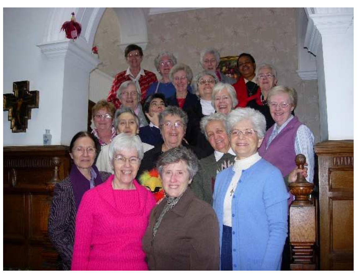
The 24th March came and having hugged and said fond farewells...all went home to "auld clothes and porridge" as they say in Scotland.