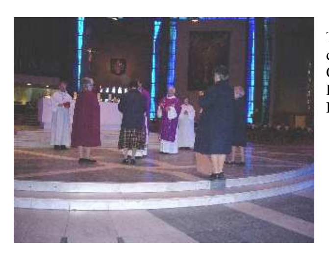
Visit to the Roman Catholic Cathedral

Those who went to Liverpool for the planned day out were delighted with the experience of Mass in the Metropolitan Cathedral, lunch in Seafield and Arrowsmith, a visit to Sacred Heart College (old Seafield) a tour of our first foundations in Liverpool, and a quick visit to the Anglican Cathedral.