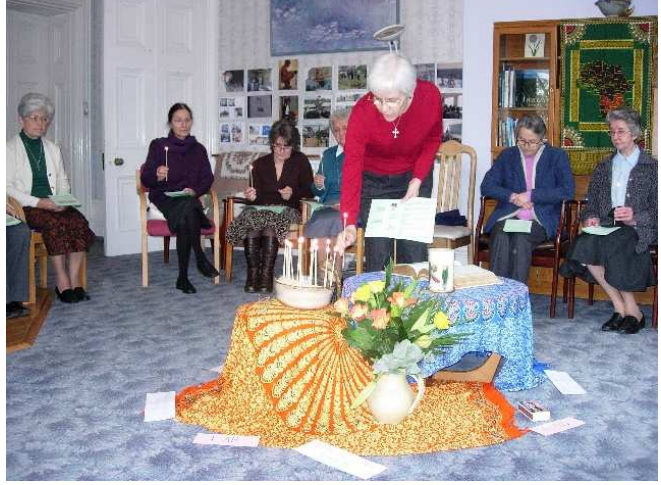
Celebrating St. Patrick's Day during the EGC