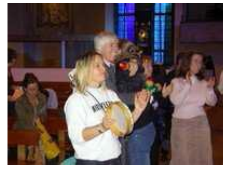
Mass with people with disabilities