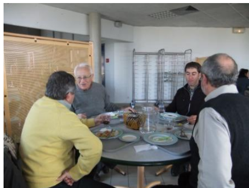
Maison Jean Gailhac