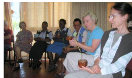
The seeds have grown

Other topics that were discussed were Volunteers, New Foundation and Criteria for Mission (page 6 General Chapter Document 2007) and a proposed New Members meeting. Throughout the meeting there was a sense of deepening the Vision and Commitments of the last General Chapter and some initial discussion regarding the next General and Provincial Chapters envisages us continuing further. At one point we were asked to name some common growth, new life points and what still stays with me is the tremendous richness and growth of different forms of collaboration, networking and relatedness that is among us, a potential that is still emerging like the seeds we planted on the first day.