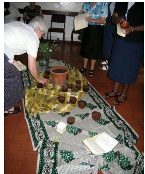
Ritual of planting of seeds

Religious life finds itself today in a situation of deep searching, of creativity and pruning. The Spirit who dwells in us, continually quenches our thirst with water from the Fountain that is always replenished. We are drawn and inspired by love, which calls us to fill situations of darkness with prophetic light and to dwell courageously in new horizons. The future of Religious life lies in living fully our mystical yearning with our traditional calling to prophecy.