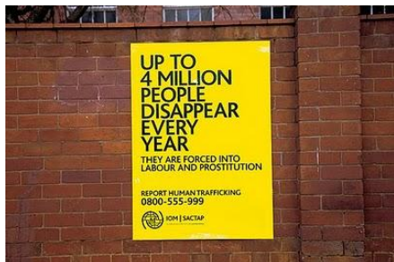
IOM South Africa Launches a Campaign Against Human Trafficking Prior to FIFA World Cup 2010

The meeting during the following days varied from reports around the globe to setting up a structured network with a representative from each continent net- working in turn with all the leaders of religious conferences in each of their countries. The reports varied from impressive stories of shelters for trafficked women to training centres to political corruption and advocacy work.