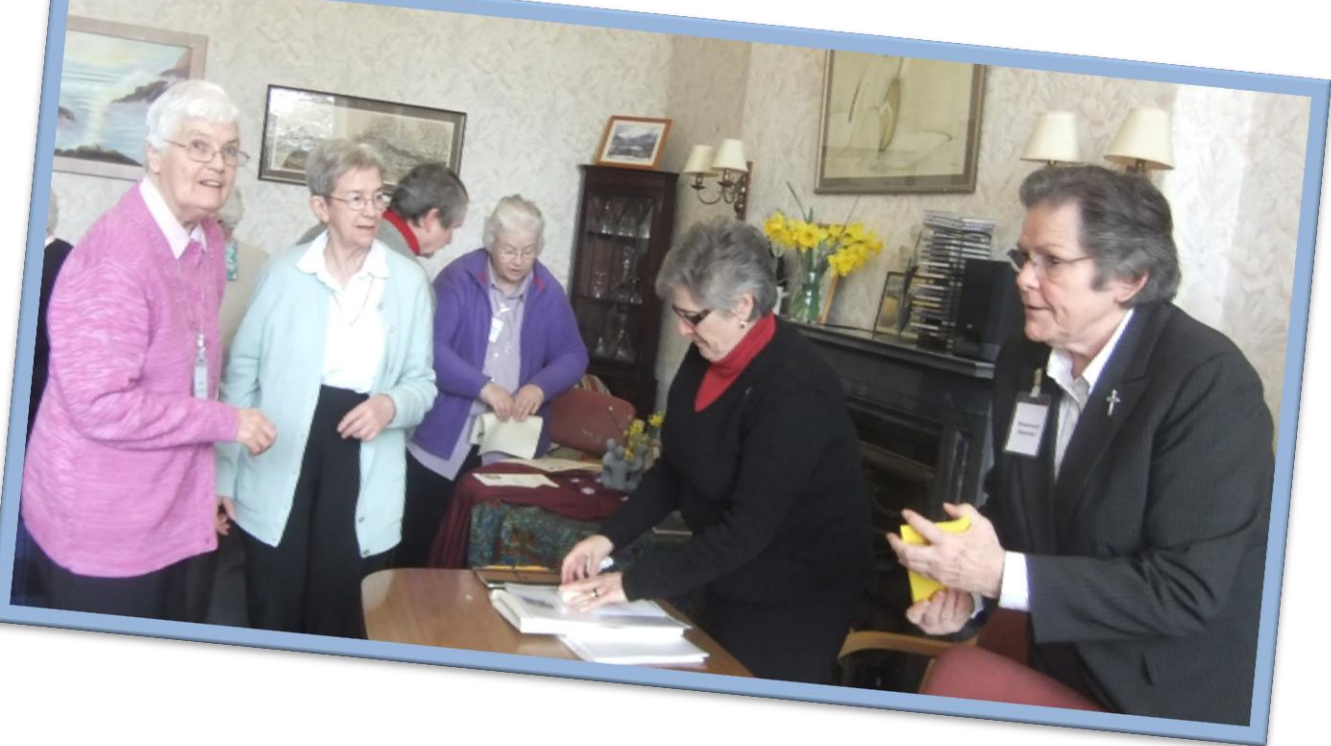
..and in action during the meeting