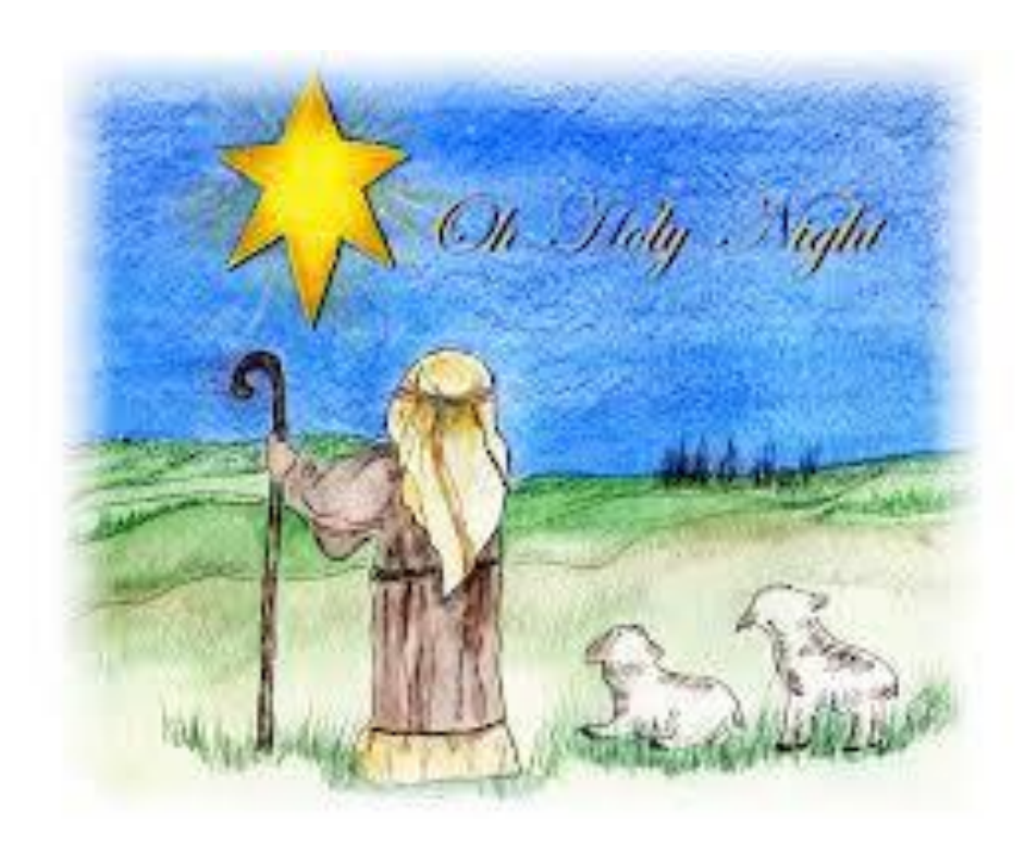
Listen and gently be present to the mystery of God in our midst from the Provincial team.