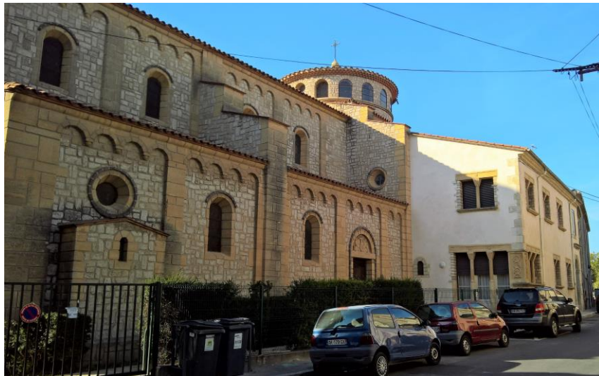
The Mother House, rue Ermengaud