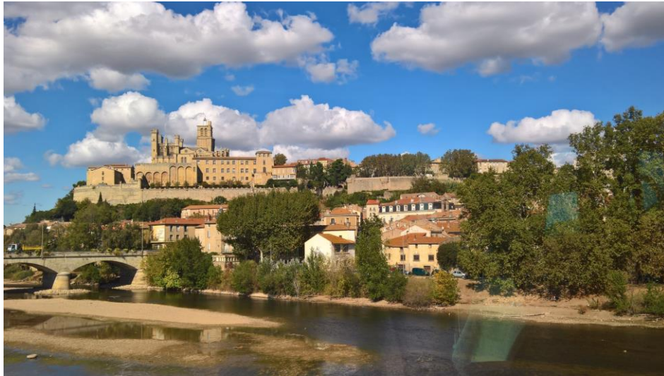
Béziers through the westbound train window