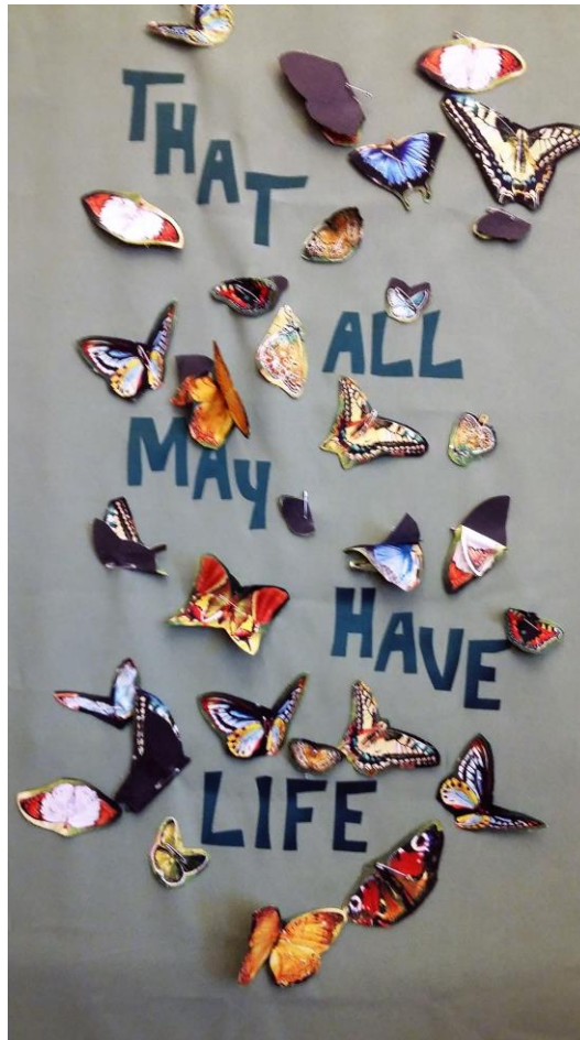
Banner based on the theme for the weekend