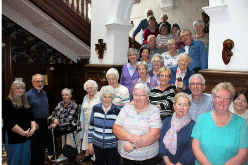
Noddfa Group, 2017