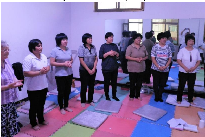
Two photos of the retreat participants