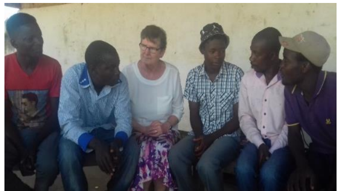
A meeting with the band members

YOUTH EMPOWERMENT GROUP: This project is at its early stages and provides business management skills for disadvantaged youth. The project manager, with the assistance of other experts in management, trains them in business planning, including simple financial systems, and methodologies while at the same time they embark on small projects such as banana tree planting, carpentry, chicken rearing and one group of youth are starting a band. In due time they will be trained in marketing.